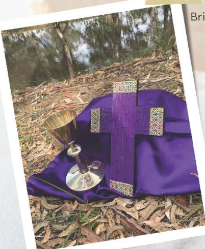
OLSH OUTDOOR LENTEN MASS Tuesday 28th March 12pm

Bring a plate to share a brunch in the Chevi centre afterwards. RSVP Friday 24th March. principal@olshelmore.catholic.edu.au (03) 5432 6254 Weather permitting.