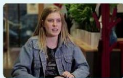
Teenagers talking about relationships with parents