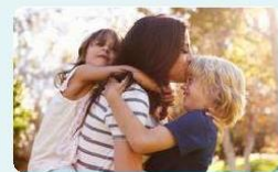
raisingchildren.net.au talks about building positive relationships for parents and children.